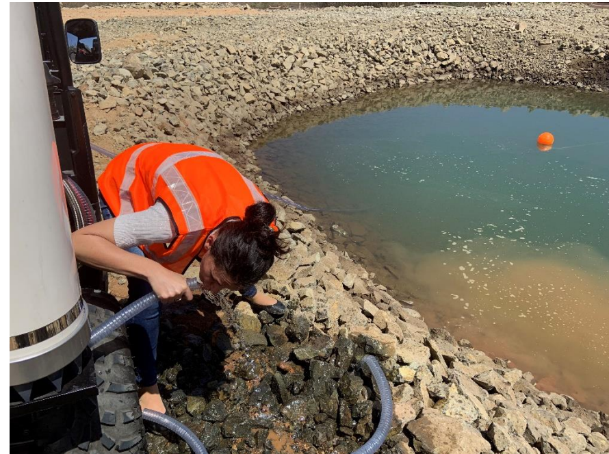
The source of the water: mines effluent

GALMOBILE system can treat all types of water source, even water from the mine, and produce drinking water according to WHO water standards.